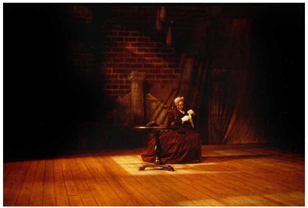
>> Trelawny of the Wells Theatre 111