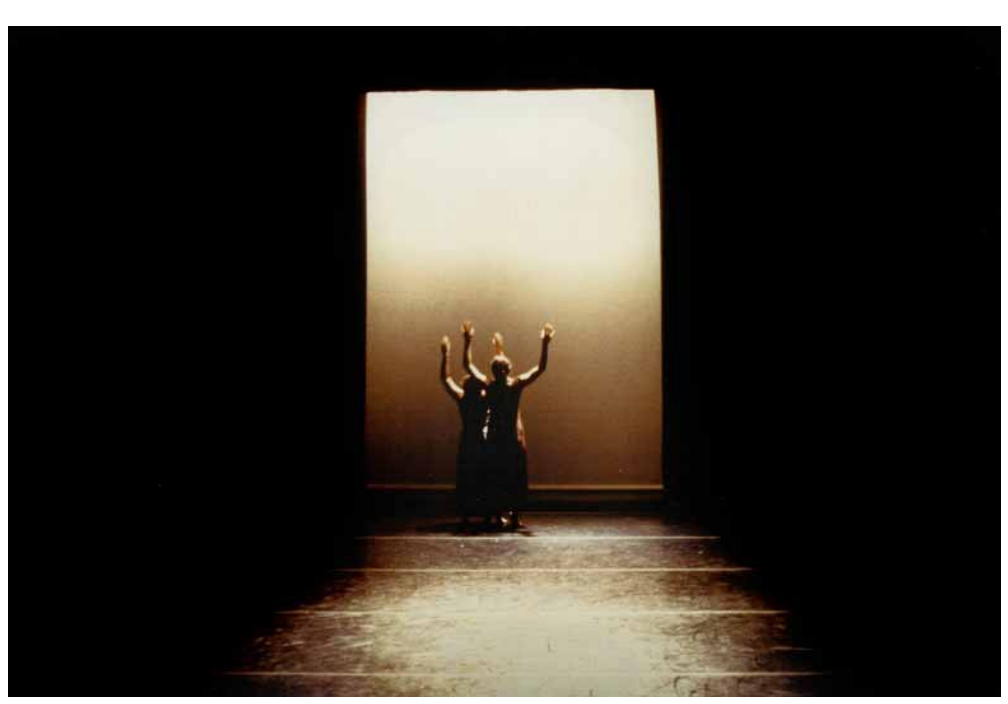
>> Fallen From Grace Theatre 111