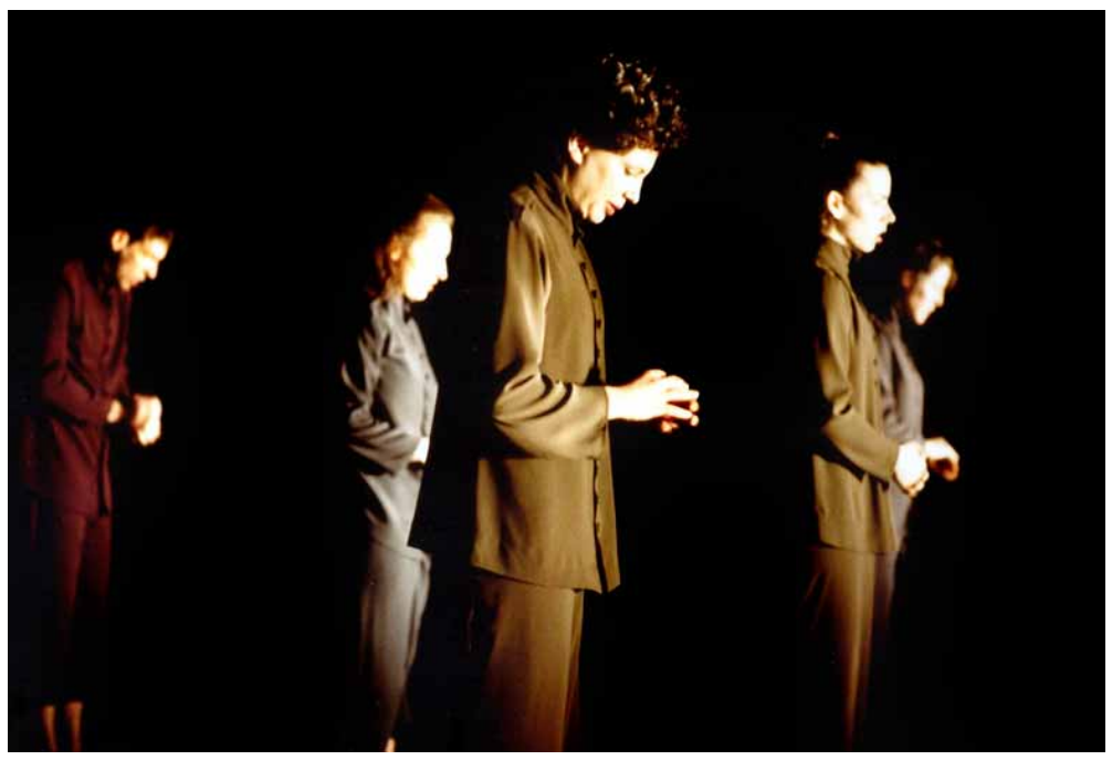
>> Peak Sacred Theatre 111