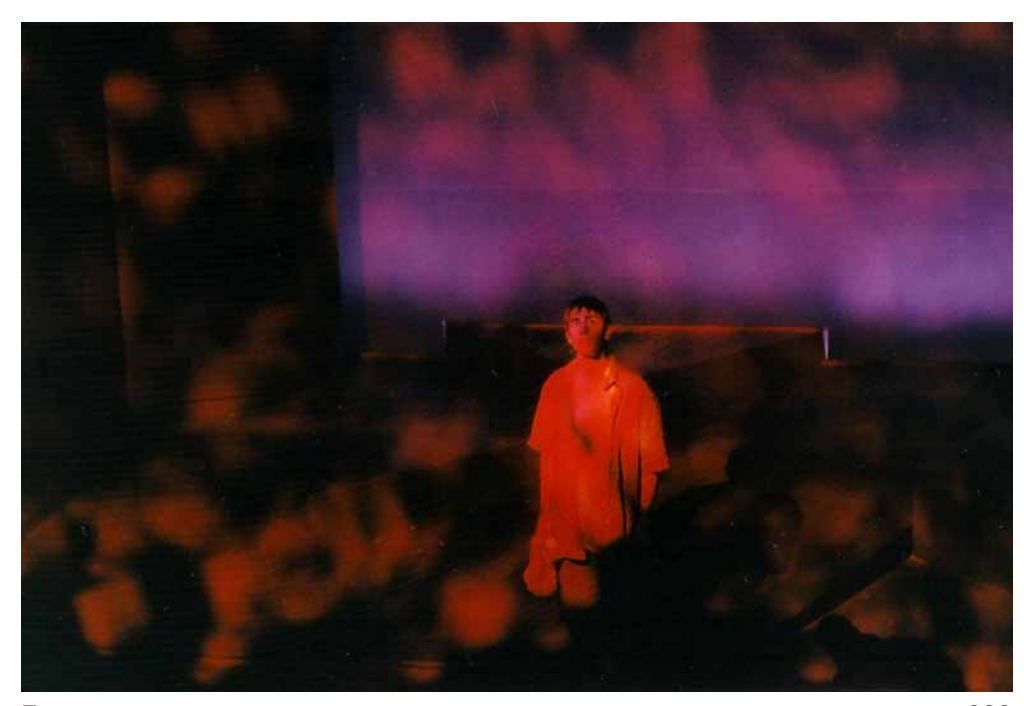
>> Four Manhattan Theatre Club