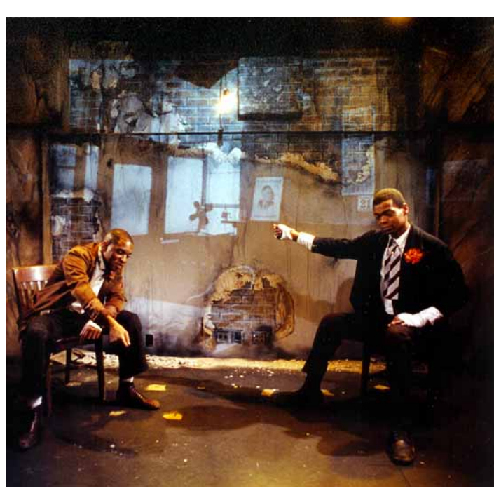
>> The Minstrel Show Queens Theatre in the Park