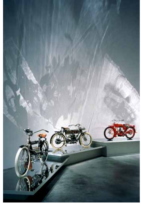
>> The Art of the Motorcycle Guggenheim Museum, Las Vegas