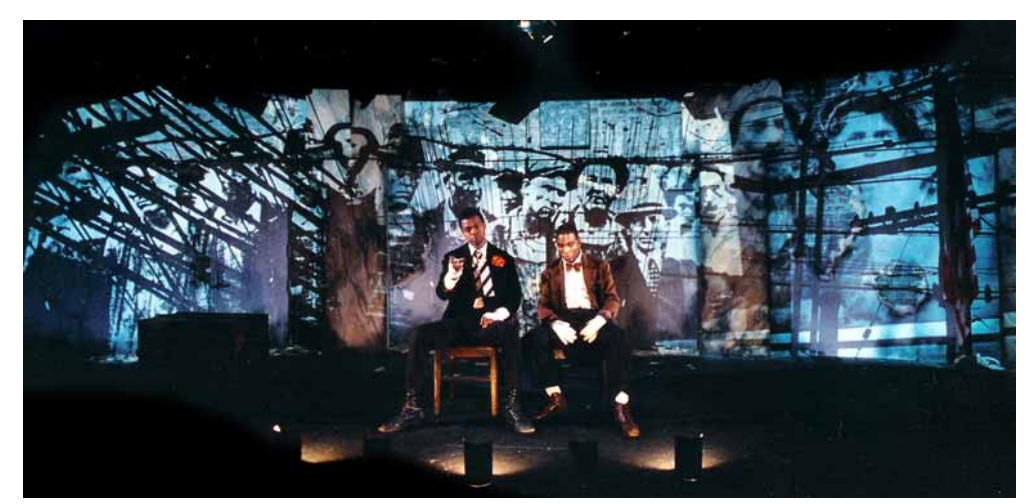
>> The Minstrel Show Queens Theatre in the Park