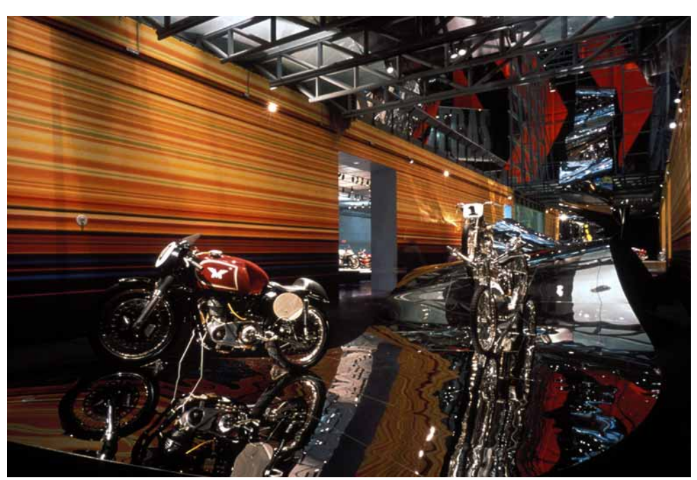
>> The Art of the Motorcycle Guggenheim Museum, Las Vegas